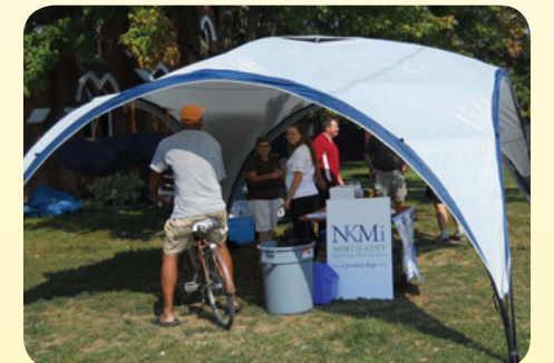
Many people enjoyed the free lunch and $600 was raised for charity.