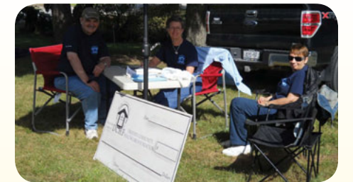
Volunteers of the Dresden Community Healthcare Foundation were thrilled with the response from the community for NKMi's Matching Funds campaign